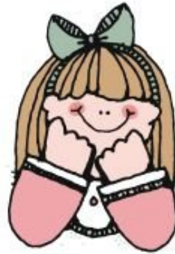
Nod Your Head!