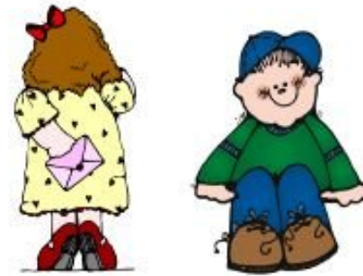
Turn Around & Sit Down!